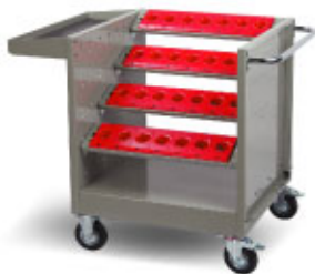
TW-4B (13-4) Package: 1 pc/2 ctn/3.7cuft N.W.: 49kgs G.W.: 51kgs • 1002Wx650Dx830Hmm