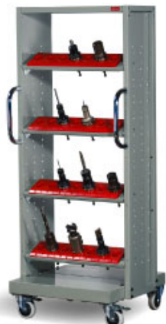
RT-6558 (13-14) 653Wx600Dx1460Hmm (excl. castor height) Package: 1 set/2 ctn/4.21cuft Weight: 50kgs