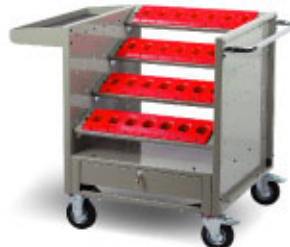
TW-4B1D (13-5) Package: 1 pc/2 ctn/5.3cuft N.W.: 50kgs G.W.: 53kgs Drawer base 595Wx650Dx160H mm Drawer 540Wx390Dx112H mm