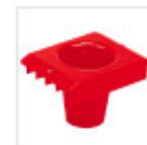
BT-50 (13-12) 104Wx137Dx93Hmm 5pcs can be placed on the tool cart.