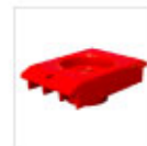
HSK-63 (13-13) 84Wx137Dx49Hmm 6pcs can be placed on the tool cart. (European standard)