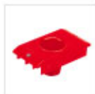
BT-35 (13-9) 74Wx137Dx63Hmm 7pcs can be placed on the tool cart.