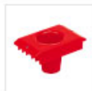
BT-40 (13-10) 74Wx137Dx63Hmm 7pcs can be placed on the tool cart.