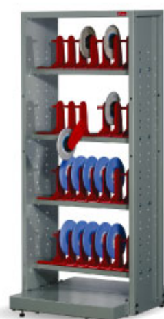
GR-6558 (13-15) 653Wx600Dx1460Hmm (excl. wheel height) Package: 1 set/2 ctn/4.21cuft