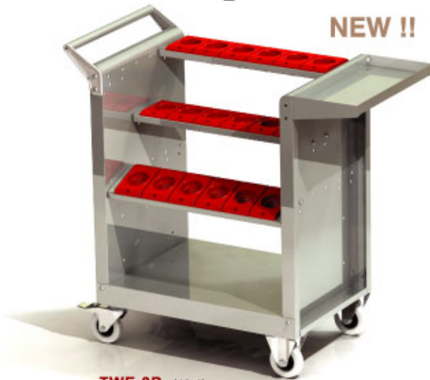
TWE-3B (13-1) Package: 1 pc/2 ctn/3.7cuft