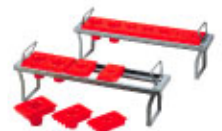
BTS-595 (13-7) 595Wx143Dx225Hmm Cutting tool rack (incl. handlebar and stand)