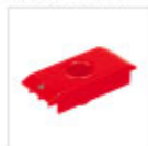
BT-30 (13-8) 64Wx137Dx48Hmm 8pcs can be placed on the tool cart.