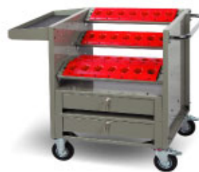
TW-4B2D (13-6) Package: 1 pc/2 ctn/5.04cuft N.W.: 60kgs G.W.: 64kgs Drawer base 595Wx650Dx160H mm Drawer 540Wx390Dx112H mm